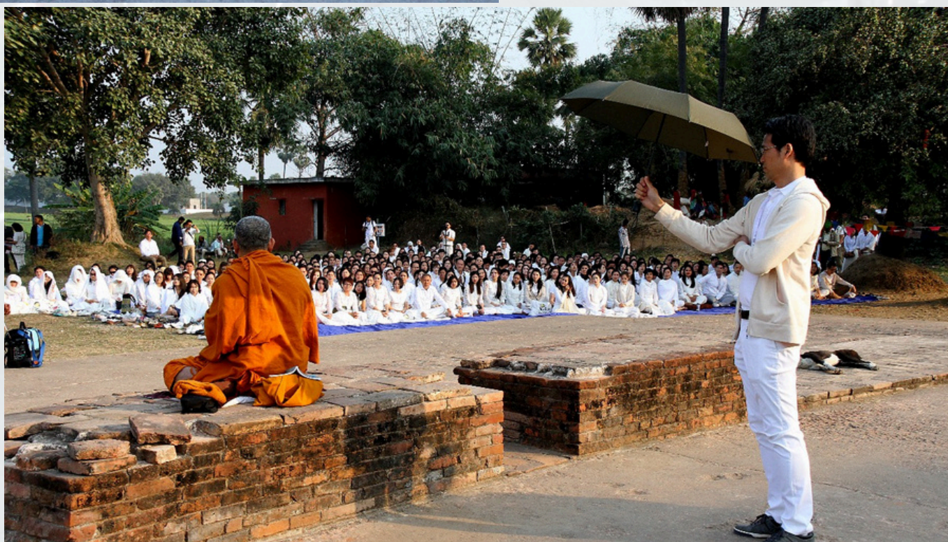
SUJATA STUPA, BODH GAYA

J.P.SHARMA: Due to my strong interest in traveling, I often requested time off from my position in the government to explore different destinations. During these trips, I captured photographs of the places I visited and later drafted brief articles about them to submit to various newspapers and magazines. Seeing my articles published alongside my photographs brought me great joy. My goal was to showcase a visual narrative of the tourist and religious sites I explored, capturing the landscape, architectural features, and local activities through my camera lens. Over time, I found immense pleasure in these activities, leading to the pursuits you now see before you.