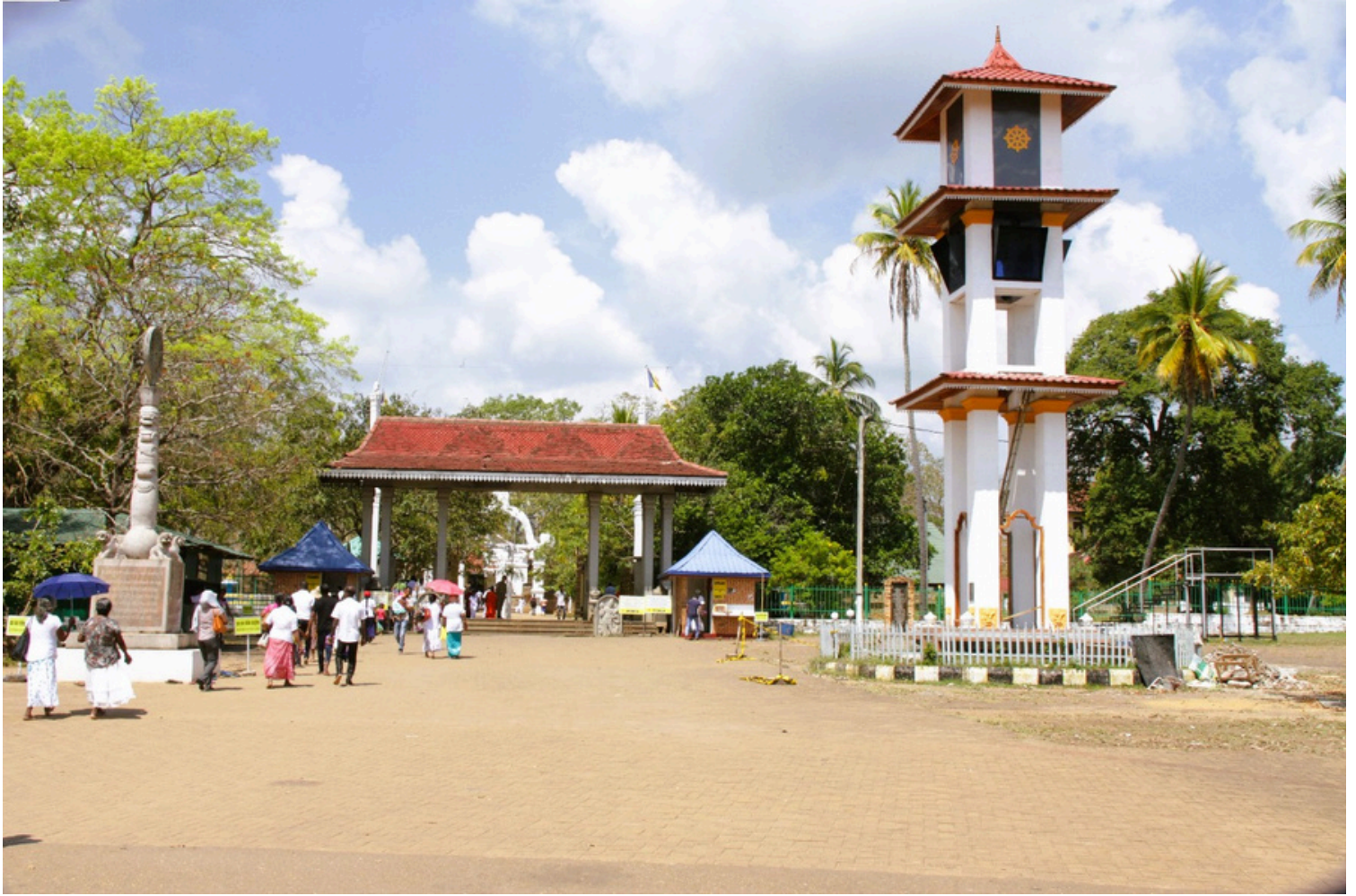
ANURADHPURA ,ANCIENT CAPITAL OF SRI LANKA