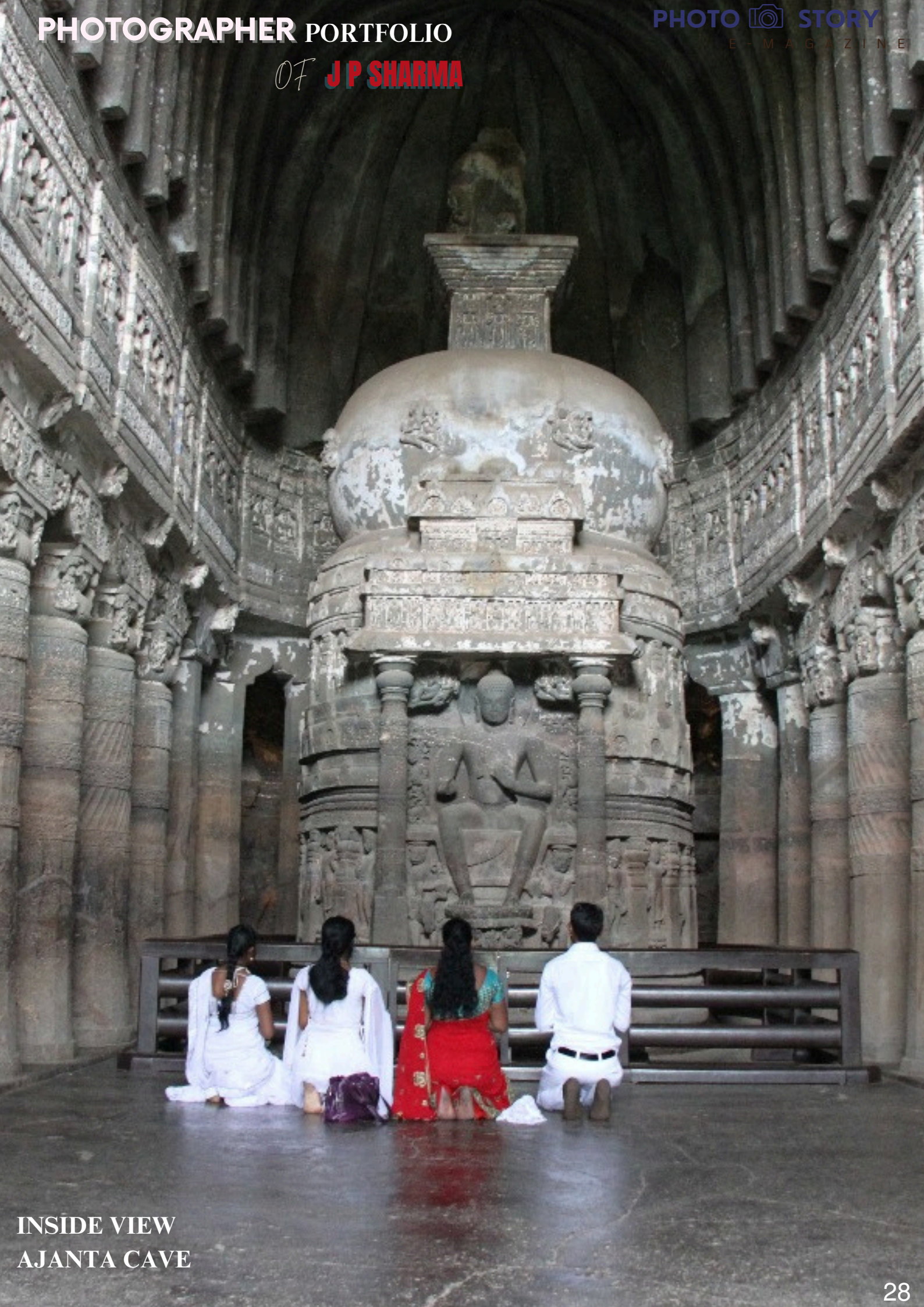
INSIDE VIEW AJANTA CAVE