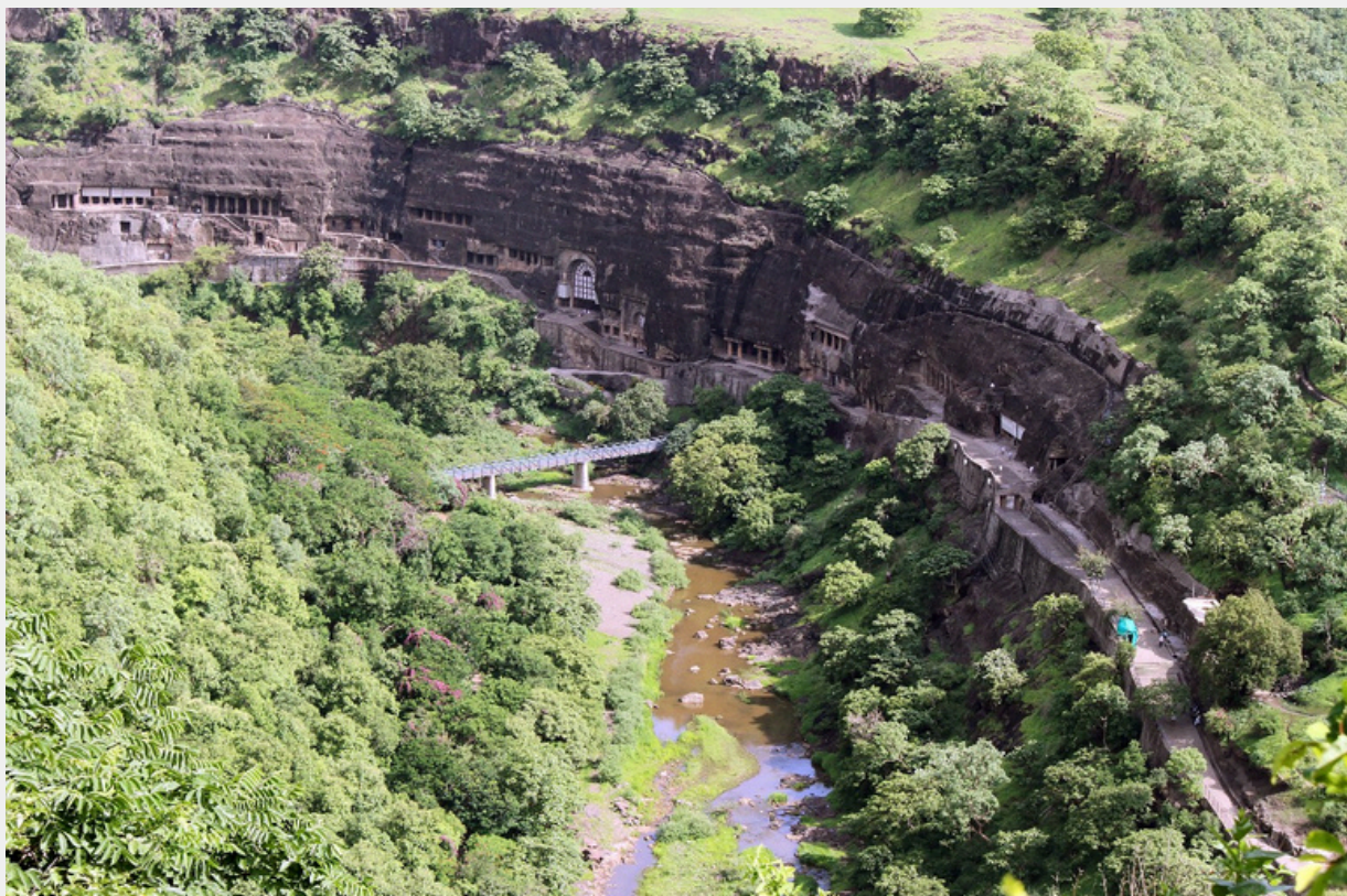
BIRD EYE VIEW OF AJANTA CAVE, AURANGABAD, MAHARASTRA