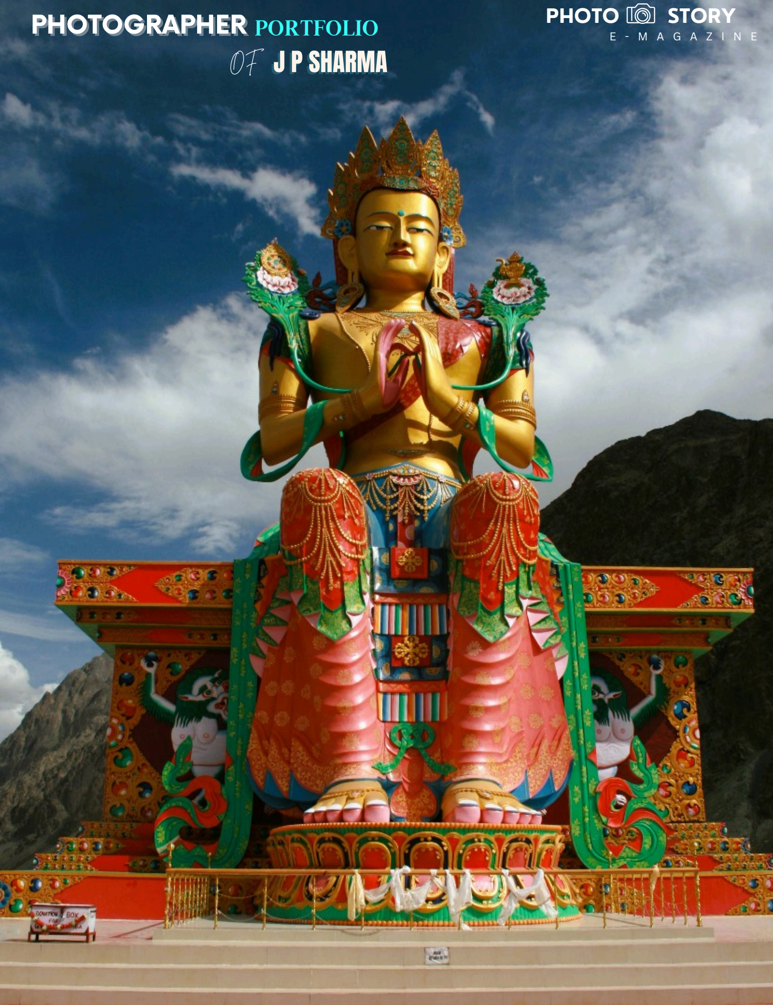
MAITREYA BUDDHA NUBRA VALLY, LADDAKH