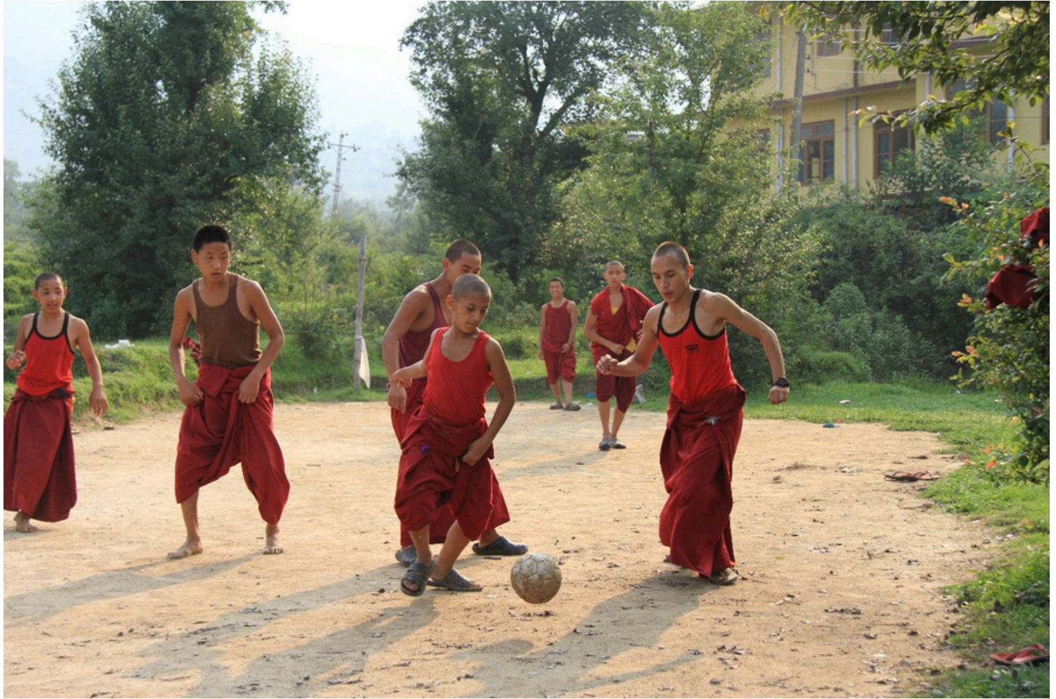
MONKS PLYING GAME DHARAMSHALA, HIMANCHAL PRADESH